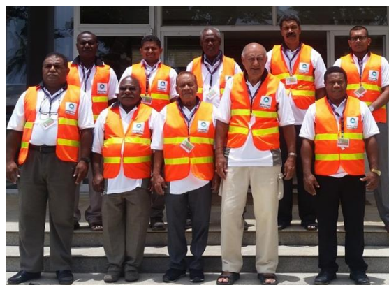
The MSG Elections Observers, prior to departure for their respective constituencies