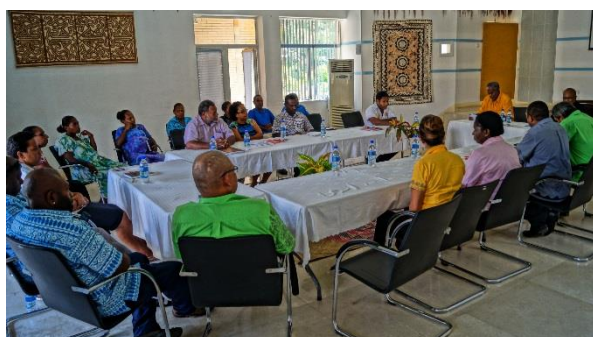
The first Staff meeting with the new Director General held at the Secretariat's Conference Room