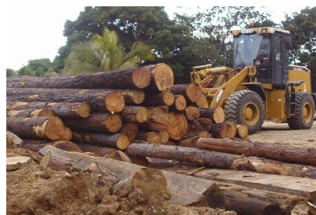
Pine logs near Labasa, Fiji