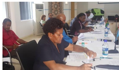
Aviation and Tourism Dialogue in session

The 2 nd MSG Aviation and Tourism Sectoral Dialogue held in Port Vila on 10-11 March 2016 provided Members with the platform to discuss issues relating to the tourism industry and connectivity through air transportation. Among the key recommendations from the Dialogue were the need for: consultations on regulatory reforms and streamlined responsibilities to facilitate sustained growth through aviation and tourism; the review of Members' respective Bilateral Air Services Agreement to accommodate a Fair Sky Policy; the pursuit of harmonized aviation regulations within the MSG sub-region; the development of an MSG Tourism Marketing Strategy; and, supporting tourism as a driving force for enhancing sub-regional economic integration under the MSGTA.