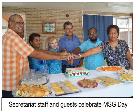
Secretariat staff and guests celebrate MSG Day

As endorsed at the 19 th Leaders Summit in Noumea on 14 March 2013, the 14 th of March is being celebrated annually as MSG Day to commemorate the formal establishment of the Group through the signing of the six-point "Agreed Principles of Cooperation Among the Independent States in Melanesia" on 14 March 1988 in Port Vila by the former Prime Ministers namely, Mr Paias Wingti of Papua New Guinea, Mr Ezekiel Alebua of Solomon Islands, and the late Father Walter Lini of Vanuatu. MSG Day on 14 March 2016 was thus celebrated during an afternoon tea hosted by the Secretariat that was also attended by staff of the Vanuatu Department of Foreign Affairs and representatives of SPC based in Port Vila and Noumea.