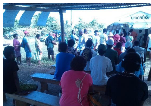
Voters queuing at the Beverly Hills Polling Station in Port Vila

The Governance and Sustainable Development Division began the year early with its co-ordination of the MSG Elections Observers Group that observed the Snap General Election in Vanuatu. Experiences from the Observers Group's first engagement in Fiji in 2014 and then in Vanuatu would undoubtedly be beneficial for further engagements as Members conduct national elections. Remarkably, MSG's representation in the Pacific Islands, Australia and New Zealand Electoral Administrators alliance is testament to the credibility of the MSG Observers Group. The Division also successfully organised the MSG Police Commissioners