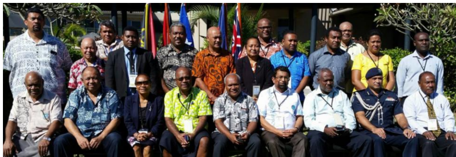
Participants of the Special Budget Senior Official Meeting in Lautoka

A Total Consolidated Budget of VT565,560,072 was approved for 2016 by the Governing Body at its meeting held on 14 October 2015 in Port Vila. This Total Budget is made up of a Regular Budget of VT257,643,421 with a Programme Budget of VT307,916,651 . This is a reduction of 26% from the previous year. The Regular Budget is funded predominately by Members' Assessed contributions and Voluntary contributions to meet the operational costs of the Secretariat including staff emoluments. The Programme Budget is funded by donor partners targeted at specific projects and activities. Members' contributions were also used to finance certain Core positions for the Programmes.