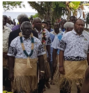
Hon. Sogavare and Hon. Salwai lead the procession in Motalava

Let me now highlight a historic bilateral event which the MSG Eminent Persons Group that I was privileged to be part of would be proud of. On 07 October 2016, I joined my counterpart from Vanuatu, Hon. Charlot Salwai Tabimasmas in Motalava, Torba Province, North Vanuatu in signing the Solomon Islands-Vanuatu Border Treaty, culminating 33 years of maritime border negotiations. The Treaty will reinforce cultural, economic and social exchanges between Temotu Province of Solomon Islands and Torba Province of Vanuatu. While it helps with the MSG 2038 Prosperity for All Plan's goal of increasing "trade between Members at rural adjacent borders", more work is to be done to formalize exchanges between Papua New Guinea and Solomon Islands, especially for Bougainville, Western Province and my home Province of Choiseul.