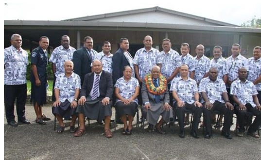
Police Commissioners and Senior Officials, at their Conference in Suva