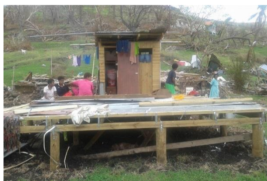
Devastated by Cyclone Winston, a homeless family of Nayavutoka Village, Ra Province, Fiji

Solidarity within the MSG Sub-region was clearly demonstrable as the Secretariat coordinated the mobilisation of resources from Members to assist with rehabilitation in Fiji following Cyclone Winston in February, just as they did to Vanuatu after Cyclone Pam last year. Funding provided by Member Governments to Fiji included FJ$3.9million from Papua New Guinea, FJ$1.3million from Solomon Islands and FJ$188,000 from Vanuatu. This was in addition to humanitarian assistance from Governments, the private sector and civil society groups. The Republic of Indonesia donated FJ$10.38million to the Fiji Prime Minister's National Disaster Relief and Rehabilitation Fund,