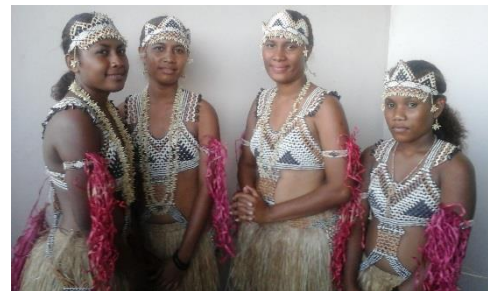
A glimpse of Melanesian culture