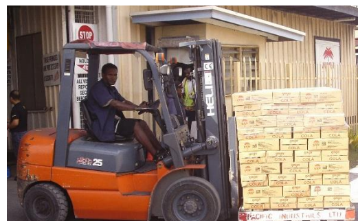
Enterprises like Paradise Industries in Rabaul, Papua New Guinea can benefit from the MFTA

Leaders also welcomed the conclusion of negotiations on the revised MSG Trade Agreement (MSGTA) and they agreed to fulfill their respective national statutory requirements before signing the new Melanesian Free Trade Agreement (MFTA). May I say with some pride that Solomon Islands was the first Member to endorse the MFTA when I signed the Agreement on 18 November 2016, and I look forward to other Members joining my country in early 2017. The Special Summit also approved