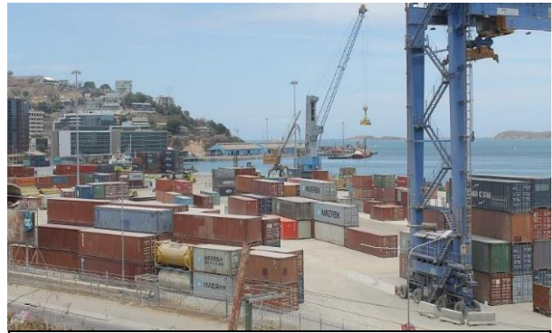
The shipping port of Port Moresby