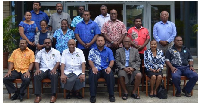
SCLII Meeting participants in Port Vila

The MSG Sub-Committee on Legal & Institutional Issues (SCLII) Meetings held in Honiara on 17-18 March 2016 and in Port Vila on 23 November 2016 discussed the national ratification and implementation of instruments entailing those Treaties and Agreements that Leaders had endorsed. The instruments discussed comprised the following: Treaty on Reciprocal Enforcement of Foreign Judgments; Treaty on Custody and Maintenance; Framework Treaty on the Protection of Traditional Knowledge and Expressions of Culture; Agreement Establishing the Regional Police Academy; and Framework Agreement on the Formed Police Unit.