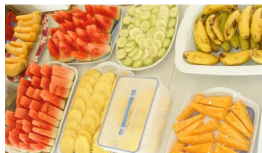
A platter of local fruits at the King Solomon Hotel in Honiara, demonstrates agritourism business opportunities