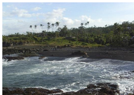
Part of the coastline in Tanna