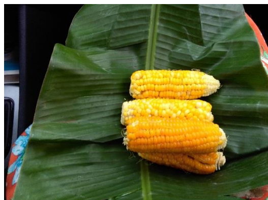
Corn sold in banana leaves around Port Vila exemplifies linkages between the agrifood sector and local markets