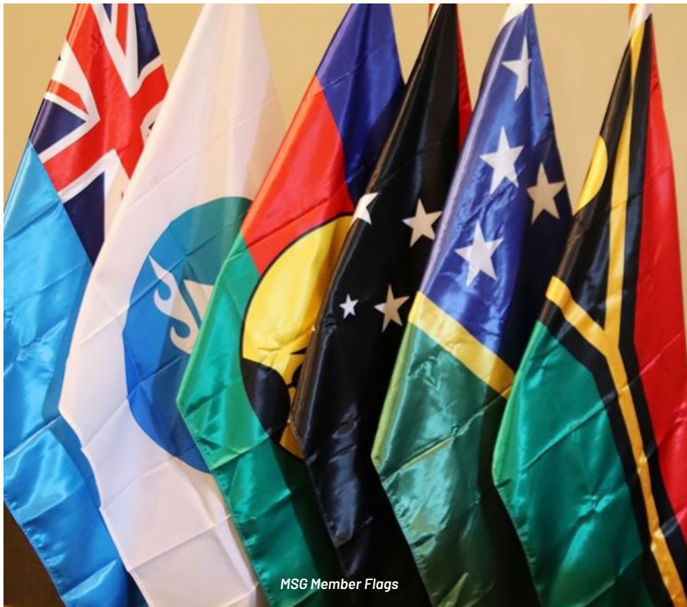
MSG Member Flags