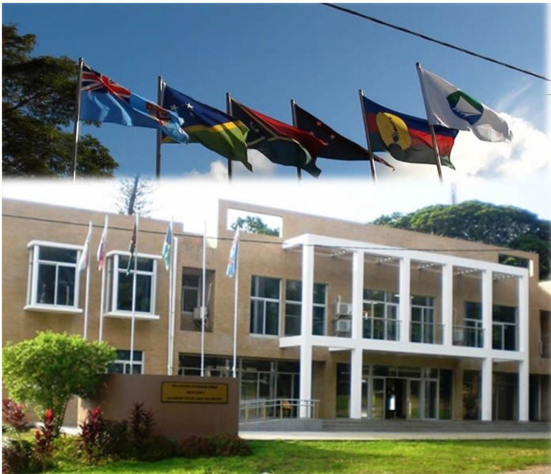
The MSG Secretariat Headquarters in Port Vila, Vanuatu.

He said, we cannot postpone our response to change so our response to the "new normal" constitutes several approaches, one of which is to continue to host meetings with our Members and partners through the ZOOM online medium. The MSG Secretariat continues to seek ways of improving its services to its Members in light of the challenges brought about by COVID-19.