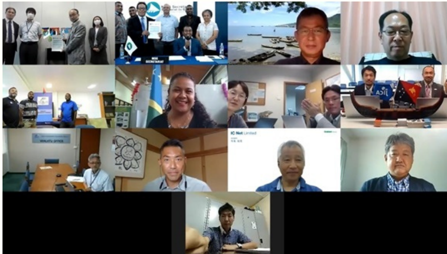
Participants of the online MOC signing between the MSG Secretariat and JICA on 2 September, 2020.

The Melanesian Spearhead Group (MSG) Secretariat and Japan International Cooperation Agency (JICA) signed a Memorandum of Cooperation (MOC), in the area of Fisheries and Marine Resource Management on 2 September, 2020.