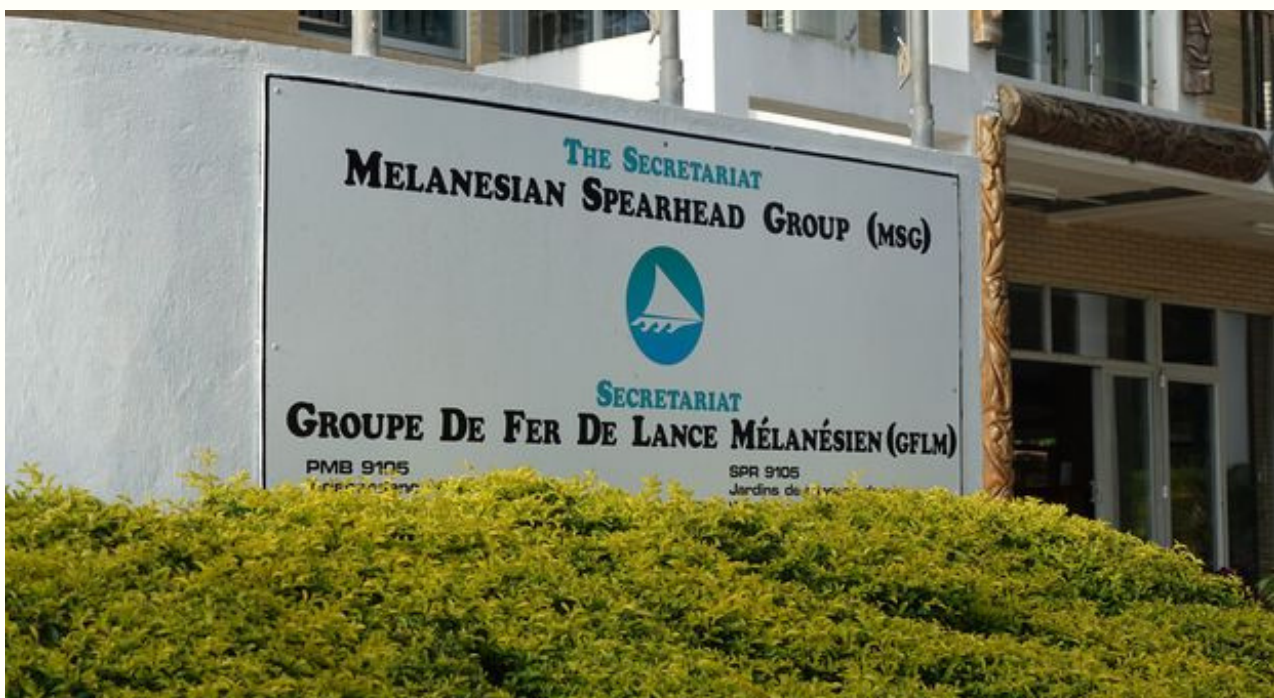
The MSG Secretariat has been commended for advancing the Melanesian Free Trade Agreement (MFTA).

During the consultative meeting, the Secretariat was assured of PNG's support of the MFTA. It is understood that inter-regional trade between the MSG Members has been one of the original principles of cooperation agreed to during the formation of the MSG Group.