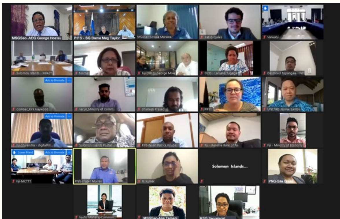
Participants of the workshop on the MSG E-Commerce Report hosted by the MSG Secretariat.

The online workshop complemented the initial workshop hosted by PIFS on 3 November, 2020.