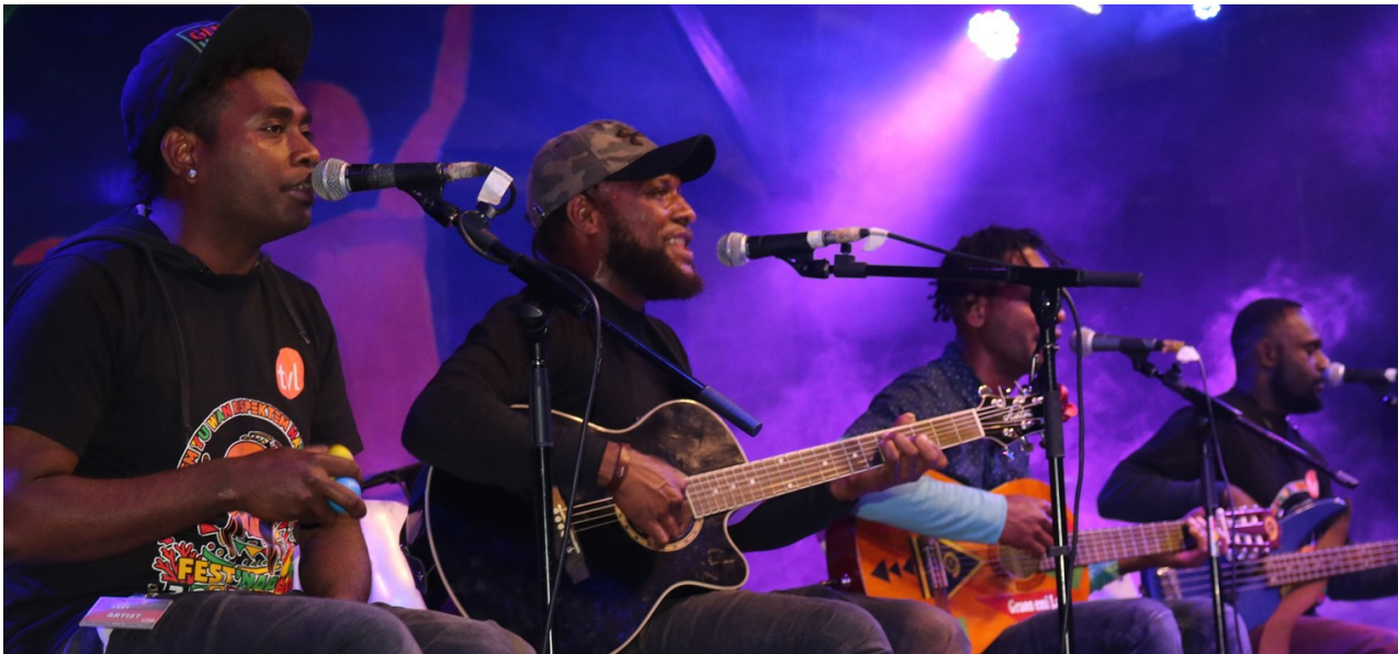
Action from the 2019 Fest' Napuan Music Festival in Port Vila.

The necessary documents enabling this activity to be realised is currently being put together by the Vanuatu Ministry of Culture.