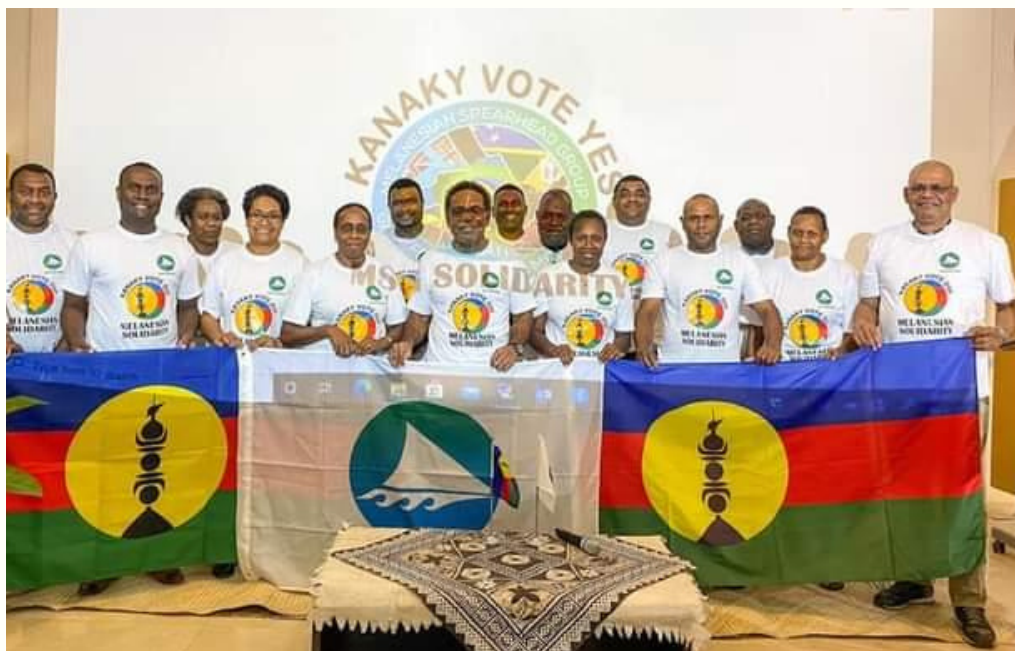
Staff of the MSG Secretariat in Port Vila showing their support for the FLNKS, Independence Referendum in New Caledonia, which was held on 4 October, 2020.

God bless FLNKS and the Kanak People of New Caledonia.