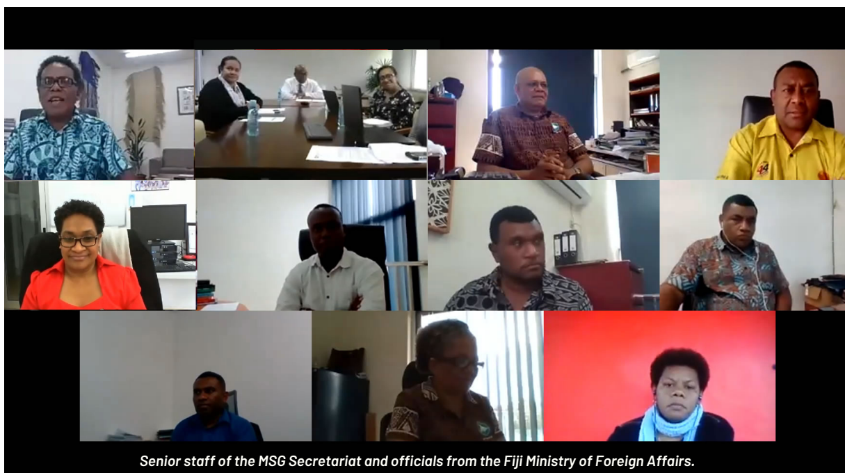
Senior staff of the MSG Secretariat and officials from the Fiji Ministry of Foreign Affairs.

The Deputy Secretary in his concluding remarks, thanked the ADG and his staff at the MSG Secretariat for the successful conduct of the first online meeting and for the Secretariat's ongoing good work. The meeting was the second successful consultative one done online with Members' focal points.