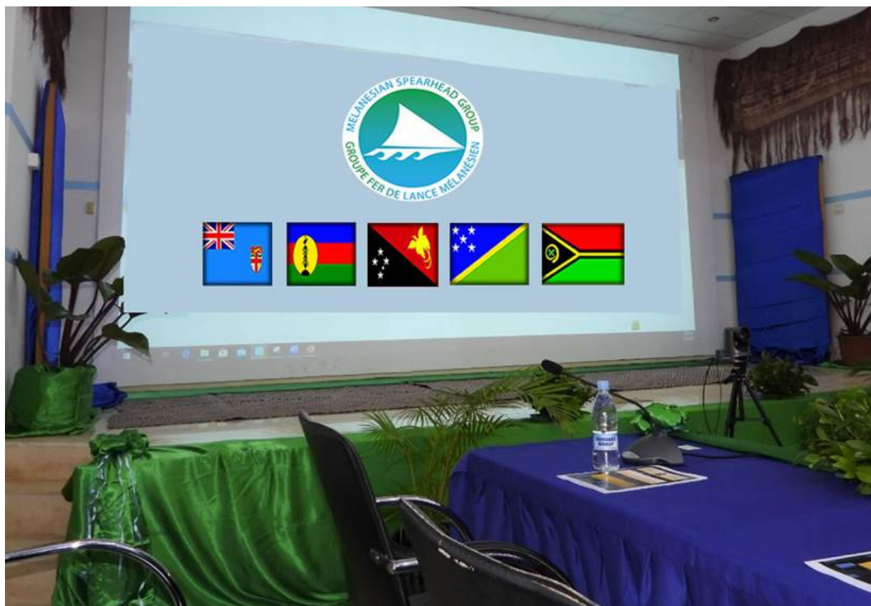
The possibility of an online MSG Biennium Leaders' Summit is currently being discussed.

The proposal was brought to the attention of the SOM Chair during the first virtual consultative meeting between the PNG Department of Foreign Affairs & International Trade and the MSG Secretariat on 9 September, 2020.