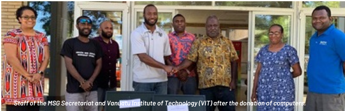
Staff of the MSG Secretariat and Vanuatu Institute of Technology (VIT) after the donation of computers.