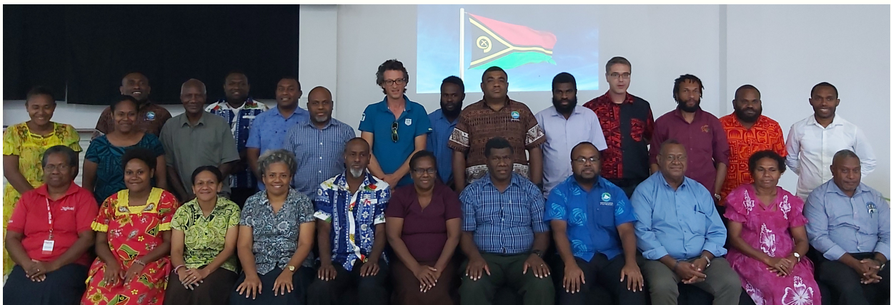
Participants of the Validation Workshop on “Drivers of Change” for the 2050 Strategy for the Blue Pacific Continent, at the Melanesian Hotel Conference Room in Port Vila.

The Melanesian Spearhead Group (MSG) Secretariat was appreciative of the invitation to participate in the “Drivers of Change” workshop as the first step towards the development of the 2050 Strategy for the Blue Pacific Continent.