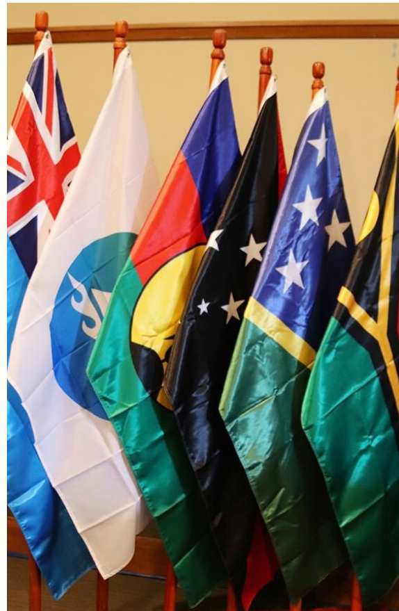
Member flags of the Melanesian Spearhead Group

The safeguarding, protection and promotion of Melanesian Arts and Culture is one of the priorities of the MSG Secretariat. Therefore, the urgent need to reinforce the collective determination of the MSG as a sub-region that is respected for its promotion of Melanesian arts and culture, customs, traditions and values. Our culture is our land and our identity, our culture is our environment, our culture is our food, our culture is our people and our culture is our future. As a sub-region, we must safeguard our unique arts and culture and ensure that they are instilled well in our people for our sustainable future.