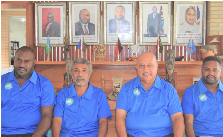
Members of the MSGOG to the 2020 Vanuatu National General Elections

The Political and Security Affairs (PSA) Programme was involved in a number of activities in the first quarter of 2020 including the observation of the 2020 Vanuatu National General Election through the MSG Observer Group (MSGOG), upon the invitation of the Vanuatu Government.