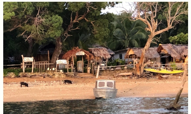
Above Photo: A coastal village in Vanuatu.

Other discussions are focused on the Secretariat and SPC to facilitate the Fisheries Technical Advisory Committee to meet and review the Roadmap and implementation framework in 2020.