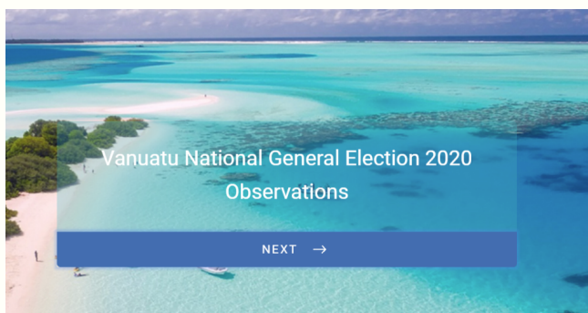
Left: Online portal for data collation and presentation in real time for the 2020 Vanuatu National General Elections