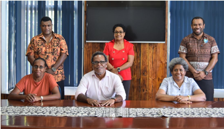
Members of the MSG Advisory Committee on COVID-19 at the MSG Secretariat HQ in Port Vila