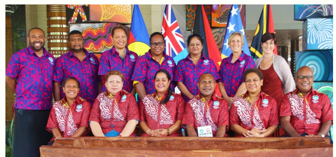
Participants at the inaugural MSG Ministers for Women and Senior Officials Conference on Eliminating Sexual and Gender-based Violence (SGBV) in Fiji.

As an outcome to the inaugural Conference, the MSG Secretariat is also working towards drafting its first Gender Framework.