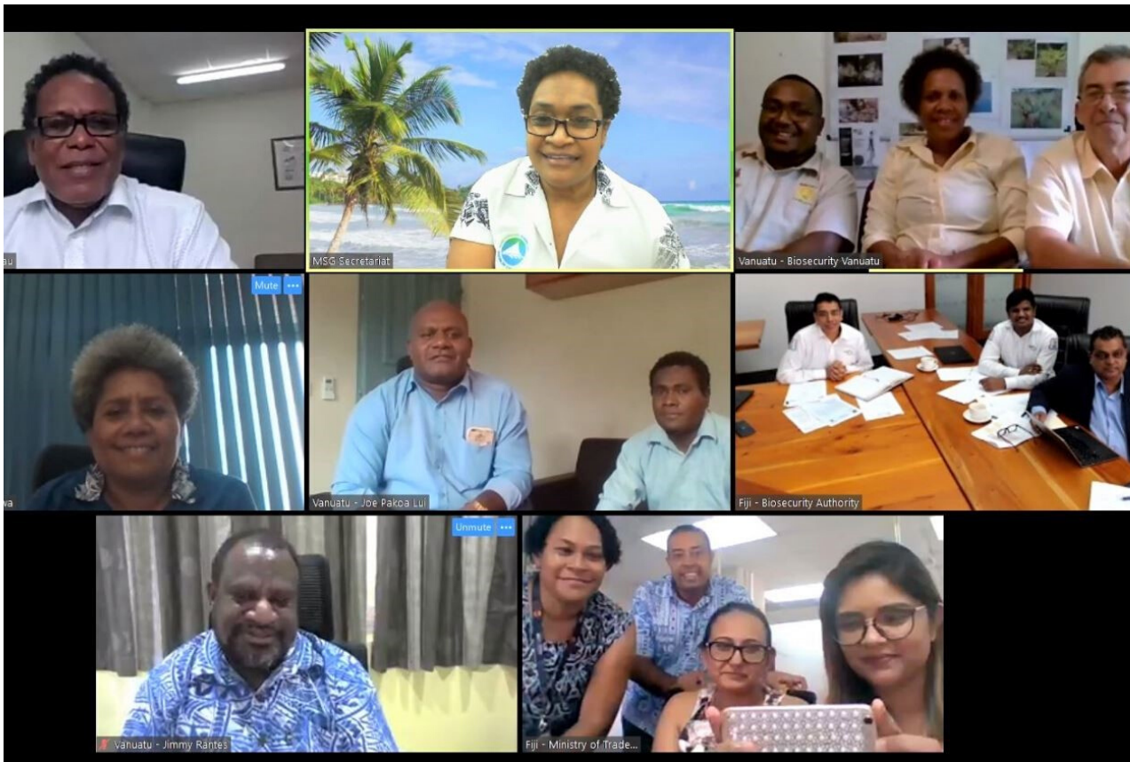
Staff of the MSG Secretariat and government officials from Fiji and Vanuatu take part in the first online bilateral consultations

In the face of the COVID-19 pandemic, the Melanesian Spearhead Group (MSG) Secretariat embarked on a new initiative using virtual meeting rooms where Members can continue to collaborate online in real time via the internet.