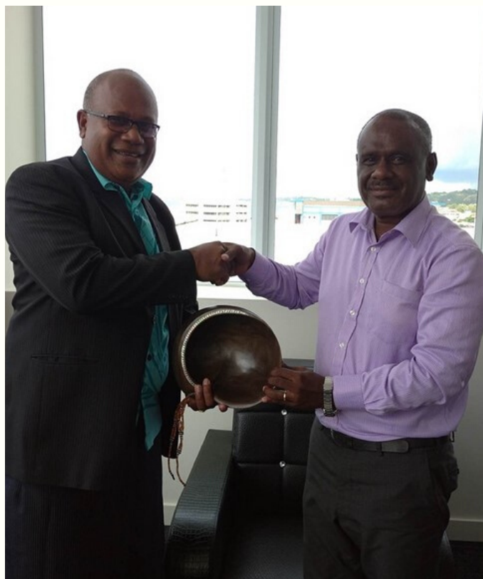
Hon. Jeremiah Manele MP, Solomon Islands Minister of Foreign Affairs presenting a gift to Ambassador Amena Yauvoli.