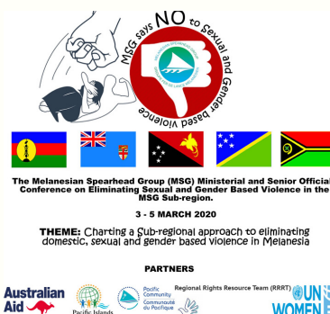
Right: A sample of the event visibility poster used at the Inaugural MSG Ministerial & Senior Officials Conference on Eliminating Sexual & Gender Based Violence in Nadi, Fiji