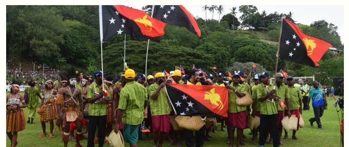
The people of Vanuatu (left) and Papua New Guinea (right) celebrate the 6th Melanesian Arts Festival in 2018 in Honiara, Solomon Islands