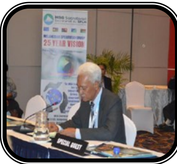
Hon. Henry at the Roadshow

ference in Apia, Samoa. "The future looks bright for an enhanced partnership, and complementarity between MTEC and MSG for the greater integration of the Pacific region," Hon. Henry highlighted. Further opportunities for MTEC-MSG collaboration are being considered for 2015 covering the areas of sub-regional trade policy and facilitation, as well as investment policy and private sector development.