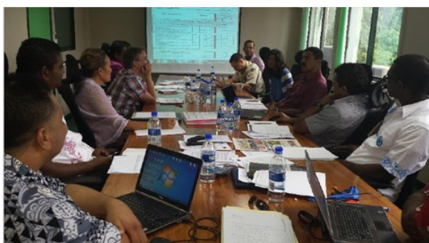
PITAP Procurement workshop in progress