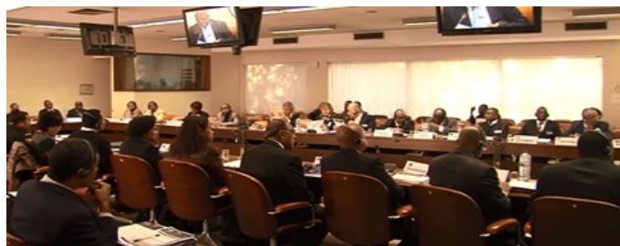
ACP PSD Symposium in session

Fijian, Samoan and ni-Vanuatu diplomats stationed in Brussels were also present. The approved PSD Strategy includes four pillars of intervention, which are: improving the business climate; developing entrepreneurship and MSMEs; increasing access to financing for MSMEs; and strengthening MSME access to national and international markets, while promoting regional integration. The new ACP Strategy will be beneficial to the Secretariat's key 2015 activity of formulating an MSG PSD Strategy, which is stipulated under the