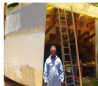
Boatbuilding industry in Honiara

ties under PITAP. As their country's Investment Promotion Agency, FID together with their MSG counterparts, is expected to participate and benefit directly from the investment policy advisory support that the Secretariat will include in its 2015 Work Programme. The new year is obviously going to be a busy one for Solomon Islands as it assumes the MSG Chair, taking over from the FLNKS.