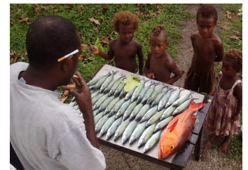
Roadside fish sales in West Guadalcanal, Solomon Islands