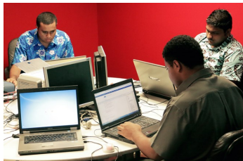
Developers at work