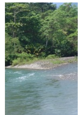
Parts of the ecosystem