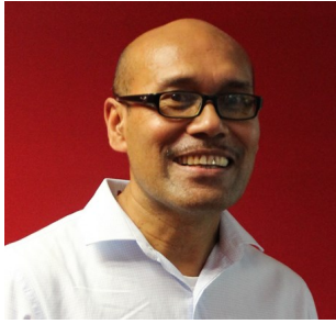
A delighted Semi