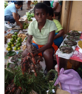
Market sales in Suva, Fiji