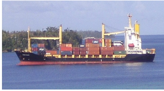
Cross-border trade in Port Vila... intra-regional transportation issues were also discussed at the Symposium