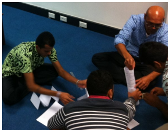
Staff team building activity

“ delight them ”, the motto of Fijian-owned Software Factory, speaks volumes about the company’s corporate culture in ensuring the satisfaction not only of its customers, but also of its customers’ customers. The 14-year old Suva-based company has continued to advance its core competencies on software design for Financial Systems, focusing mainly on Loans, Savings and Superannuation.