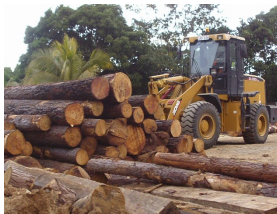
A Forestry-based industry on Vanua Levu, Fiji