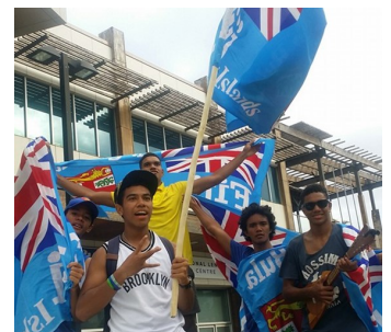
Celebrating in the streets of Port Vila were family members and friends of Secretariat staff

Besides the Rio 7s victory, other events celebrated by staff included the National Days for Solomon Islands on 07 July, Vanuatu on 30 July, PNG on 16 September and Fiji on 10 October.