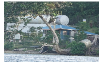
Fuel depot in Choiseul