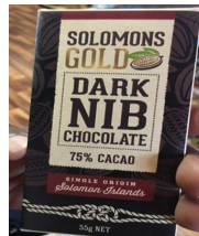
Chocolate exports from Solomon Islands