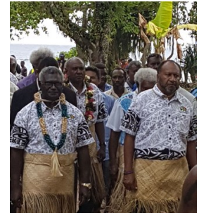
In Torba, Hon Sogavare (left) and Hon Salwai

The Treaty is anticipated to further facilitate cultural, economic and social exchanges between Temotu Province of Solomon Islands and Torba Province of Vanuatu. “After all, the two neighbouring Provinces have so much in common and the Treaty should stimulate trading between them instead of