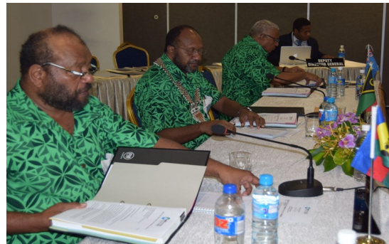
Leaders in Honiara, L-R: Mr Tutugoro (FLNKS), Hon Salwai (Vanuatu PM) and Hon. Bainimarama (Fiji PM)

MSG Leaders met in Honiara, Solomon Islands for their Special Summit on 14 July 2016 to discuss policy recommendations submitted to them by MSG Foreign Ministers. The Summit, chaired by the Prime Minister of Solomon Islands, Hon. Manasseh Sogavare, was attended by Hon. Josaia Voreqe Bainimarama, Prime Minister of Fiji; Hon. Charlot Salwai Tabimamas, Prime Minister of Vanuatu; Hon. Rimbink Pato, Minister for Foreign Affairs of PNG who deputized for the PNG Prime Minister, Hon. Peter O'Neill; and Mr Victor Tutugoro, Spokesperson of FLNKS. The key decisions of Leaders included the approval for Mr Amena Yauvoli as Director General of the MSG Secretariat. They also endorsed the implementation of Phase II activities of the Formed Police Unit and gave an approval in principle for the establishment of an MSG Police Ministers Meeting. On the application for membership by the United Liberation Movement for West Papua, Leaders