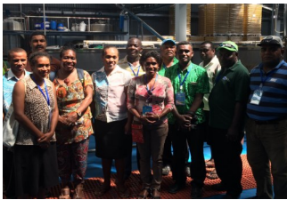
MSG officials touring the brewery

As usually reported in Melanesian Tok and in harmony with the objectives of the MSG Trade Agreement and MSG PSD Strategy, this issue profiles a beverage manufacturing company whose Managing Director also participated in the events held during the recent MSG PSD Week in Honiara.