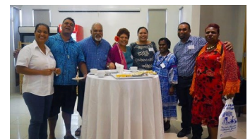
Agribusiness Forum participants in Samoa included MSG representatives

ibbean and Europe, the Forum was organised by the Technical Centre for Agricultural and Rural Cooperation ACP-EU (CTA) in partnership with PIPSO, SPC and the International Fund for Agricultural Development. A key message from the Forum relates to the replicability of successful agribusiness projects from the Pacific including Fiji and Vanuatu and from the Caribbean to other parts of Melanesia. This event followed MSG's participation at the 1 st Forum held in Nadi last year and it conforms with the spirit of MSG's MOUs with PIPSO, CTA and SPC.