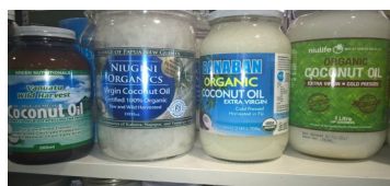
On display, products L-R, from Vanuatu, PNG, Fiji and Solomon Islands

Further collaboration with the PT&Is is expected as key findings from the above engagements are to be considered for the Secretariat's next annual work programme.