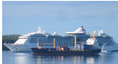
A glimpse of trade- and tourism-related Shipping in Port Vila, Vanuatu